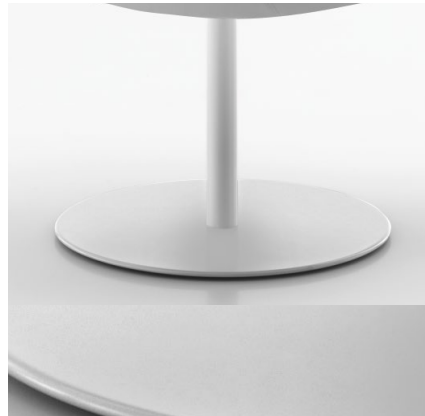
CROMO SATINATO / SATIN CHROME Trattamento galvanico / Galvanic treatment (Minimo 30 pezzi / Minimum 30 pieces)