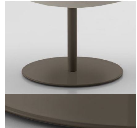
BRONZO OPACO / MATT BRONZE Verniciatura / Paint RAL 8019 (Minimo 30 pezzi / Minimum 30 pieces)