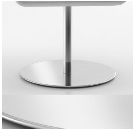
CROMO LUCIDO / POLISHED CHROME Trattamento galvanico / Galvanic treatment