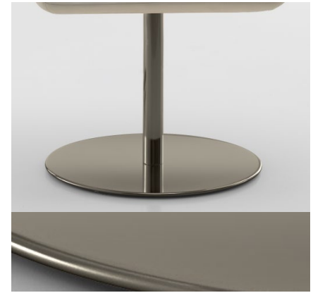
CANNA DI FUCILE / GUN METAL (Cromo nero - Black chrome) Trattamento galvanico / Galvanic treatment (Minimo 30 pezzi / Minimum 30 pieces)