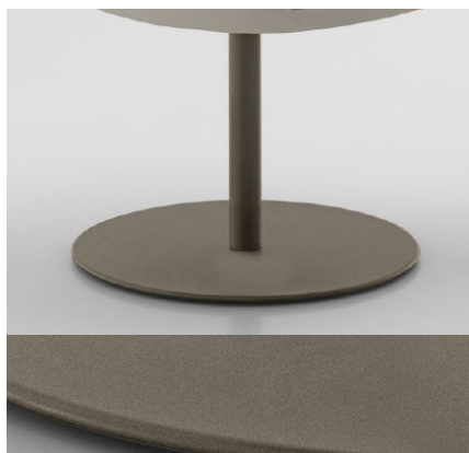
BRONZO SABLÈ / SABLÈ BRONZE Verniciatura / Paint (Minimo 30 pezzi / Minimum 30 pieces)