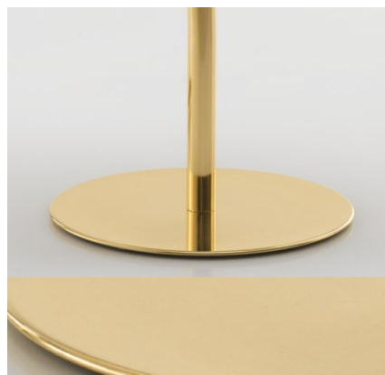
OTTONE LUCIDO / POLISHED BRASS Trattamento galvanico + verniciatura cataforetica trasparente protettiva antiossidazione e antiditate. Galvanic treatment + protective transparent cathodic dip-paint coating against oxidation and fingermarks. (Minimo 30 pezzi / Minimum 30 pieces)

Va verificata la fattibilità di ogni finitura alla base metallica richiesta. Please verify the feasibility of each finish to the requested metallic base.