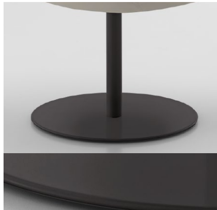
NERO OPACO / MATT BLACK Verniciatura / Paint RAL 9005 (Minimo 30 pezzi / Minimum 30 pieces)